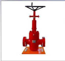
TORQUE REDUCER GATE VALVE

Actuators • Ball Valves BOPs • Check Valves • Chokes • Controls and Instrumentation Custom Designs • Flow Control Products • Frac Equipment • Gate Valves • Manifolds Pump Savers • Underbalanced Drilling • Well Test Equipment • Wellheads • Christmas Trees