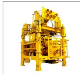
DEEP WATER RISER SYSTEM