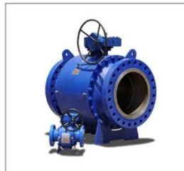
DUAL SEAL TRUNNION BALL VALVE

Subsea Intervention Systems • Riserless Systems – 10K and 15K • Subsea Stimulation Systems -15K • Subsea Shut Off Device • Subsea Emergency Response Equipment