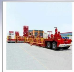
UBD TRAILER PACKAGE