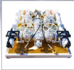
DEBRIS / JUNK CATCHER MANIFOLD